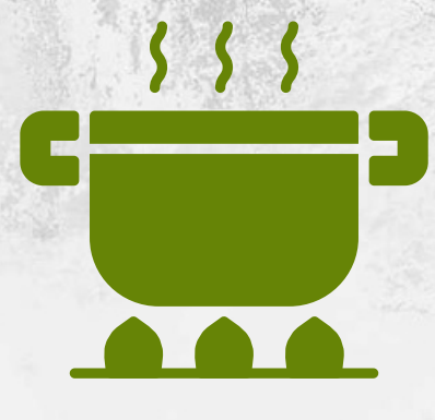
High Temperature Cooking Method